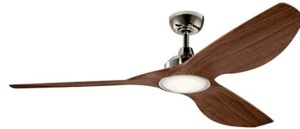
Shown in polished nickel / walnut

The Imari Ceiling Fan with Light features a propeller inspired single mold three blade design with a sophisticated look. Available in a Satin Black with Weathered White Walnut ABS blades, Matte White with Light Oak ABS blades, or Polished Nickel with Walnut ABS blades. Features a DC-188 motor, three non-reversible blades with a 65 inch blade sweep, and 14 degree blade pitch. Integrated 23 watt, 120 volt LED light module and white polycarbonate diffuser. Includes a 6 inch downrod and a DC 6-speed full function wall control system. UL listed. Suitable for damp locations. Limited lifetime warranty. Optional downrod lengths and DC handheld transmitter sold separately.