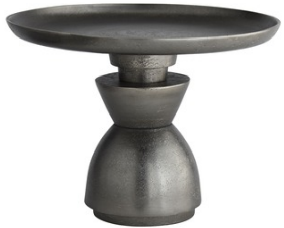
Shown in: Black

The Mahoun Centerpiece features stacked geometric shapes and craftsman style details, perfect for a variety of applications. The craft work of this cast aluminum piece echoes the Modernist aesthetic of Brancusi. Available in Graphite.