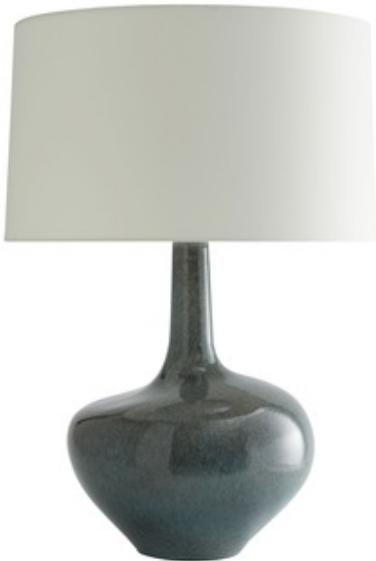
Shown in: Tidal / Ivory

DESCRIPTION The Nash Table Lamp draws inspiration from mid-century design with its asymmetric bottle-shaped silhouette. This piece has natural sophistication that instantly elevates a space. Available in an Ivory Linen drum shade. Three-way rotary switch at socket. UL and CUL listed.