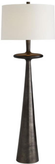
Shown in: Antique Aluminum / Off White

The Putney Floor Lamp's silhouette reveals three stacked rounded forms, a cylinder, a disk, and an elongated tapered cone base showcasing angular composition and balance. The midcentury feel of the Putney's bold form is topped with an Off-White linen shade, making this lamp a perfect fit for a modern living area. 3-way rotary switch located on the lamp's neck.