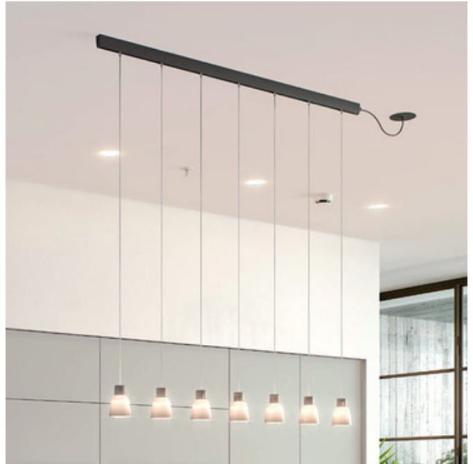
Shown in: Ebony Black / Frosted Glass

The Drip Linear Ceiling Light Pendant is a versatile, stylish light fixture that is perfect for a variety of settings including kitchen islands and dining rooms. Its clean lines and modern aesthetic work well in contemporary spaces while its warm glow creates an inviting atmosphere. Available in three sizes: 39.37 inches (model PF/05L), 55.12 inches (PF/07L) and 70.87 inches (PF/09L).