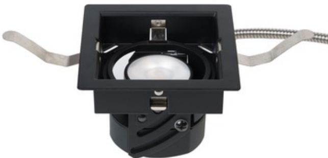
Shown in: Black

The Ocularc Architectural 3.5 Inch Non-IC Remodel Housing features a single spot light source with 0-30 degree vertical adjustment and 365 degree horizontal adjustment. Non-IC remodel housing with integral light engine and driver concealed within the fixture. Non-IC designation requires a 3 inch minimum clearance away from insulation. Accepts one honeycomb louver or optical accessory, sold separately. UL listed. Title 24 compliant. Suitable for wet locations. Dimmable with an electronic low voltage (ELV), 0-10V or TRIAC dimming (see attached manufacturer reference for dimmer compatibility. A complete fixture includes a housing and trim, sold separately.