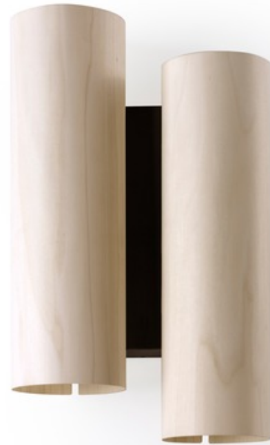
Shown in: Matte Black / Ivory White

The Black Note Duplet Wall Sconce has perpendicular shades that rise and fall with rhythmic arrangement inspired by the black keys on a piano, whose sharp and flat notes add emotion and passion to a melody. Black Note's metallic frame works harmoniously with its luminous, warm wood veneer shades. Integrated 1050mA LED module in 2700K or 4000K color temperature. 250mA constant current driver. Dimmable with a 0-10V or Triac dimmer, sold separately. ADA compliant. UL listed.