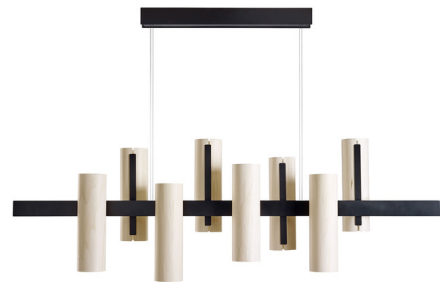
Shown in matte black / ivory white

LAMP LIFE . . . . . 50000 hours COLOR RENDERING . . . . . 90 CRI LAMP COLOR . . . . . 2700K LUMENS/WATT . . . . . 233.00 LUMINOUS FLUX . . . . . 2097 lumens