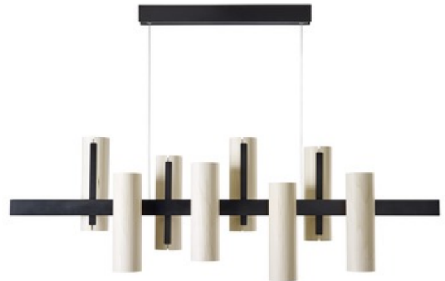
Shown in: Matte Black / Ivory White

The Black Note Keys Linear Pendant has perpendicular shades that rise and fall with rhythmic arrangement inspired by the black keys on a piano, whose sharp and flat notes add emotion and passion to a melody. Black Note's metallic frame works harmoniously with its luminous, warm wood veneer shades. Dimmable with a 0-10V or Triac dimmer, sold separately. Dual Circuit - DC: Enables independent dimming and control of the wood shades and the downlight. Supplied with four 8 foot black steel suspension cables.