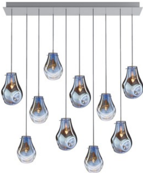
Shown in: White / Blue

The Soap Linear Multi Light Chandelier offers the magic of iridescence, the characteristic features of a soap bubble. When lit, the metallic sheen magically transforms to iridescent and translucent. Each piece is mouth blown crystal with a metal coating, making each piece an original in both shape and color. Includes a mix of small and large pendants. Note: Requires a junction box to support fixtures over 50 pounds. Includes canopy, power supply and 98.4 inch cord lengths. Cords can be pre-cut to varying lengths (see attached manufacturer installation instructions for more information). TRIAC or 0-10V dimming.