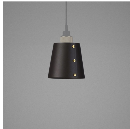
Shown in graphite

The Buster + Punch Shade is made from 1mm powder coated metal. The metal is rolled and secured with our signature coin screws in solid metal. The Graphite or Stone finish has added metal fleck to ensure an elegant satin sheen when catching the light and perfectly fits all of the Hooked Pendants, SOLD SEPARATELY.