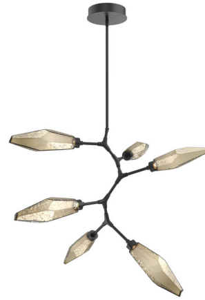
Shown in matte black / chilled bronze

The Rock Crystal Modern Vine Chandelier offers a balance of traditional and modern design by capturing the raw beauty of natural rock quartz of artisan blown glass and pairing it with an aluminum frame. Place this eye catching beauty where ever you want added glam.