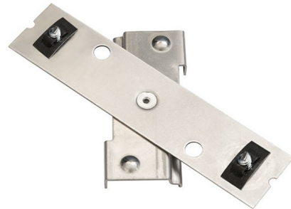
Shown in aluminum

Cirrus Channel T-Bar End Mounting Clip mounts flush anywhere along the 9/16 inch T-bar grid. Use one every two feet (sold separately).