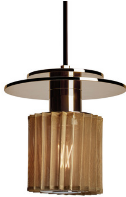
Shown in: Gold / Gold Mesh

The In The Sun Pendant pays tribute to the Sun King with its colorful hues of Gold and Silver that play with the light, casting beautiful shadows across your space. Perfect alone or group together in various sizes and colors for a more dramatic effect.