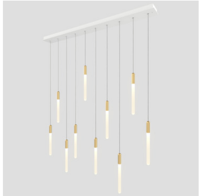
Shown in: White Canopy / Brushed Brass

The Cascadia Linear Pendant pays homage to nature and its effortless beauty. This pendant takes its name from the Canadian Cascades' white-capped mountain range and organic flow of waterways. The distinctive slender shape and soft gradation of the Opaline glow from the hand blown glass tubing hides the technical precision through an aesthetic of simplicity and a pureness in design. Whether hanging over a kitchen island, over a dining table or over a work station, Cascadia translates into a look that is both contemporary and timeless.