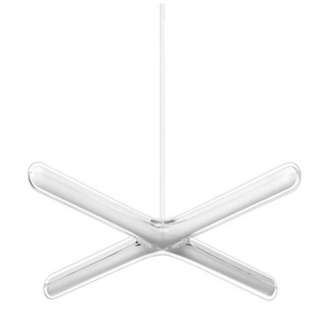
Shown in: White / Clear

The Lithium Pendant features a clean and modern design with a four point star structure, with outstretched arms. The milky white glow shines giving the fixture a warm ambiance. This fixture looks beautiful by itself or pair it with multiples to create a one of a kind look. Available in 1-light or 3-light options and three color temperature options.1-Light includes a 25 Watt 12V driver (3.1L x 1.5W x 1H) which fits inside most junction boxes, TRIAC, ELV, 0-10V dimming3-Light includes a 90 Watt 12V driver (6.73L x 2.48W x 1.47H) requiring installation in a remote accessible location, 0-10V dimming.