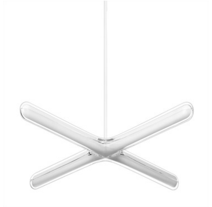
Shown in: White / Clear

The Lithium Pendant features a clean and modern design with a four point star structure, with outstretched arms. The milky white glow shines giving the fixture a warm ambiance. This fixture looks beautiful by itself or pair it with multiples to create a one of a kind look. Available in 1-light or 3-light options and three color temperature options. 1-Light includes a 25 Watt 12V driver (3.1L x 1.5W x 1H) which fits inside most junction boxes, TRIAC, ELV, 0-10V dimming 3-Light includes a 90 Watt 12V driver (6.73L x 2.48W x 1.47H) requiring installation in a remote accessible location, 0-10V dimming.