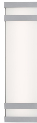
Shown in silica / frosted