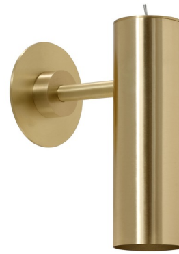
Shown in satin brass

The Heron Wall Sconce is a timeless and contemporary piece designed with noble materials. Finished in Satin Brass, the cylindrical head can adjust to direct light where you desire it. UL and CE listed. Made in England.