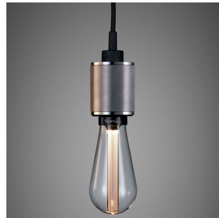
Shown in steel

The Heavy Metal Socket Pendant is a single light pendant made from solid cross-knurl pattern or linear-knurl pattern with matte rubber detailing. Includes canopy, 118 inch cord and socket. Buster Bulb shown in image is sold separately. Max 20 watts. Note: The dimmable Buster bulb requires an LED compatible dimmer switch. The non-dimmable Buster bulb is intended for use with on/off switches only and is not compatible with any dimmer switch. The Heavy Metal pendant is not compatible with Buster shades. Note: Not all options are available.