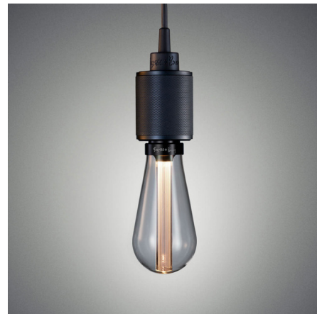
Shown in smoked bronze

The Heavy Metal Socket Pendant is a single light pendant made from solid cross-knurl pattern or linear-knurl pattern with matte rubber detailing. Includes canopy, 118 inch cord and socket. Buster Bulb shown in image is sold separately. Max 20 watts. Note: The dimmable Buster bulb requires an LED compatible dimmer switch. The non-dimmable Buster bulb is intended for use with on/off switches only and is not compatible with any dimmer switch. The Heavy Metal pendant is not compatible with Buster shades. Note: Not all options are available.