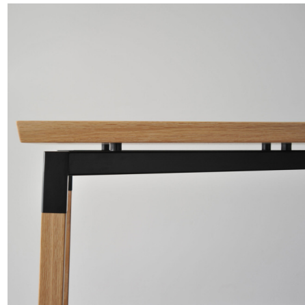
Shown in natural oak / black

The Parkdale Bench is a minimalist masterpiece that is defined by elegant details. Prominent steel components replace the connections that would typically be made from wood. A floating seat creates void space and enhances the attention paid to these essential moments of joinery. Available in two sizes and Walnut, Natural Oak, Black Oak, or White Oak finish with Black or White metal accents.