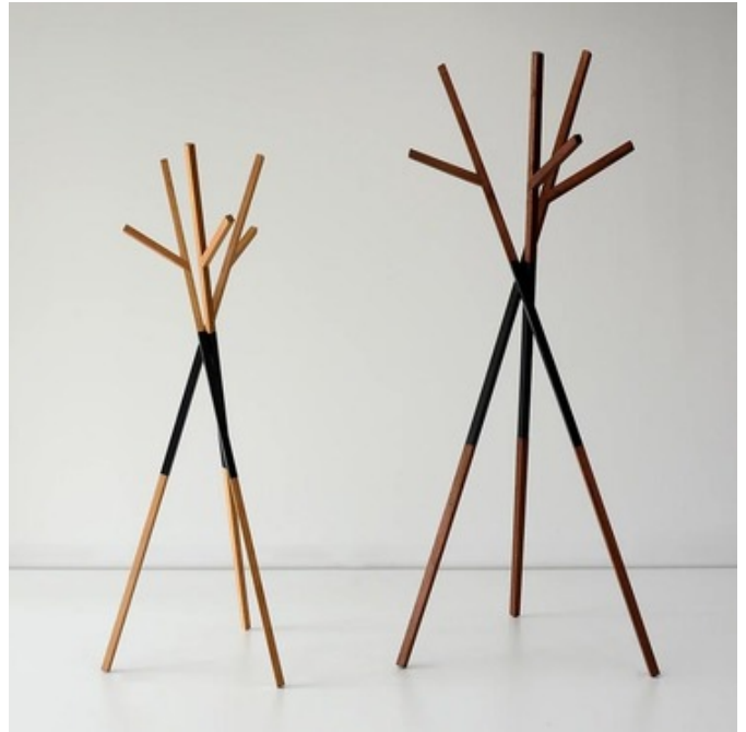
Shown in: Black / Natural Oak

The Bellwoods Clothes Rack is a playful piece for dreamers and design lovers. Named for Toronto's iconic Trinity Bellwoods Park and its soaring oak trees, this imaginative coat rack fuses three branches together through a pronged metal center. Available in Standard and Kids sizes in Walnut, Natural Oak, White Oak, and Black Oak with Black or White powder-coated metal accents.