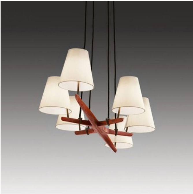
Shown in: Rosewood / Black Bronze / Natural

The Admont Linear Pendant is an elegant, organic sculptural piece perfect in virtually any decor. The oiled frame branches into individual arms, which are topped Natural silk shades that completely eliminate glare from a 60-degree angle. Available in Rosewood with Black Bronze, Oak with Black Bronze, Wenge with Black Bronze, or Walnut with Black Bronze, with a Black cord that distinguishes the Kalmar Werkstatten brand. Available in 6 and 10 light options. UL listed.