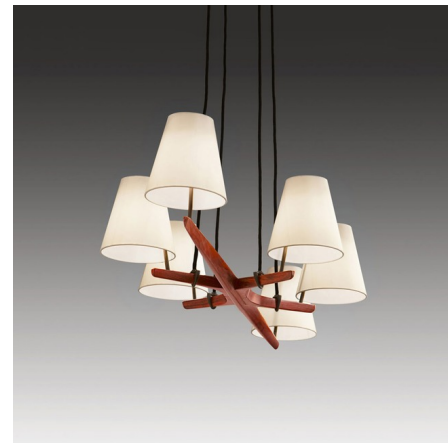
Shown in rosewood / black bronze / natural

The Admont Linear Pendant is an elegant, organic sculptural piece perfect in virtually any decor. The oiled frame branches into individual arms, which are topped Natural silk shades that completely eliminate glare from a 60-degree angle. Available in Rosewood with Black Bronze, Oak with Black Bronze, Wenge with Black Bronze, or Walnut with Black Bronze, with a Black cord that distinguishes the Kalmar Werkstätten brand. Available in 6 and 10 light options. UL listed.