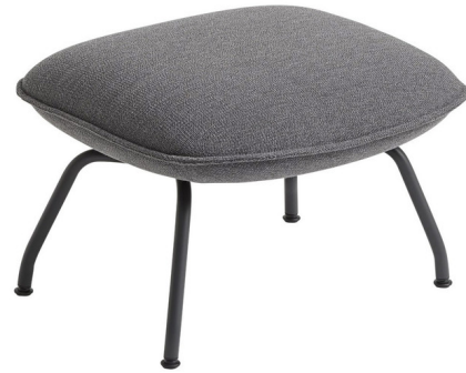
Shown in anthracite

The Doze Ottoman combines Scandinavian design with the lines of 1970s furniture to bring about a contemporary perspective on the archetypal lounge ottoman. Available in Cognac aniline leather, Anthracite Ocean, or Navy Balder. Ocean fabric is one of the most textured textiles in the Muuto catalog. Consisting entirely of man-made fiber, it is easy to clean, and its textured surface offers depth through the play of light and shadow. Balder is a highly durable wool (68%), cotton (26%), nylon (6%) blend.