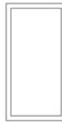
21,8 cm / 8.5"