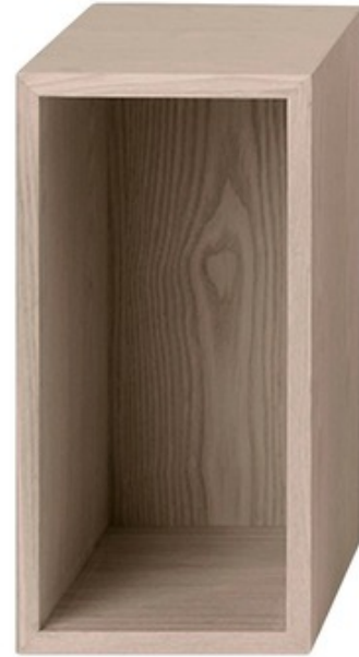
Shown in: Oak

The Stacked Storage System is a functional and versatile modular storage system that can be configured in loads of different, appealing structures to house your belongings. Whether its set up as shelving, sideboards, bookcases, or side table, the Stacked Storage is perfect for contemporary spaces with its clean lines and simple wood construction. See attached manufacturer spec sheet system guide for stacking height limits and configuration inspiration.