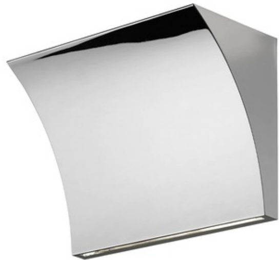
Shown in: Chrome

The Pochette Up/Down Wall Sconce features a pressure die-cast Zamak alloy structure in a Matte Gray or Chrome-plated finish. Satin finish Pyrex glass diffuser. One 20 watt (up) and one 1.5 watt (down) 2700K LED module is included. Up and down light distribution. ADA compliant. UL listed. Dimmable with an electronic low voltage, TRIAC, or 0-10V dimmer, sold separately.