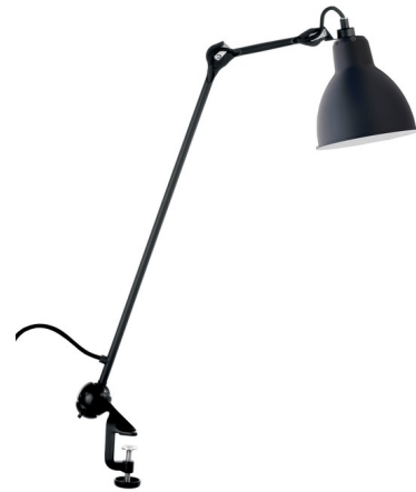
Shown in matte black / blue

PRODUCT DIMENSIONS . . . . . Cord: 84.25"