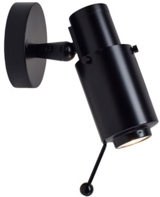
Shown in: Matte Black / Black

The Biny Spot Wall Sconce is a clean simple piece that packs a powerful punch. Straight out of a Melies or Jules Vernes world, this piece directs light to your specific space. Biny's ball joint allows rotation of 330 degrees and an inclination of 88 degrees. The directional stick allows for easy, fingerprint-free adjustment. Available with or without an On/Off toggle switch on the backplate.