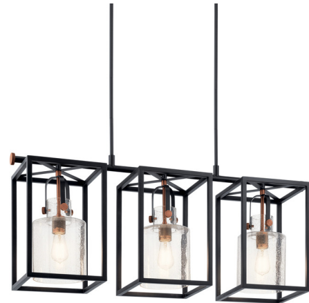
Shown in black / clear seeded