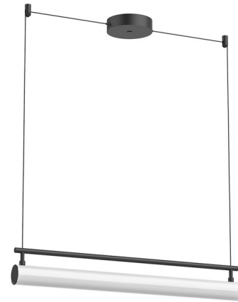
Shown in black / frosted