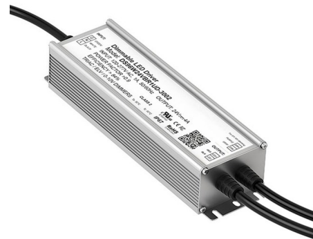
Shown in silver