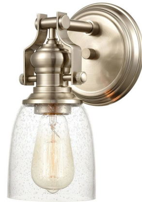
Shown in satin nickel / clear seeded

The Chadwick Wall Sconce has vintage charm with a hint of industrial styling, making it a great selection for a variety of decors. Featuring a spun socket holder with over-sized thumbscrews adding a mechanical look. Available with an Oiled Rubbed Bronze with Satin Brass socket or all Satin Nickel and Clear Seeded glass shade. Ideally suited for a vintage style filament bulb. UL listed. Suitable for damp locations.