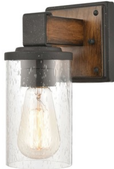
Shown in: Ballard Wood / Clear Seeded

The Crenshaw Wall Sconce features rustic combination of metalwork and Clear Seeded glass cylinders, which are suspended from rugged looking brackets. Choose from Distressed Black/ Ballard Wood finish or Advil Iron/Distressed Antique Gray. Ideally suited for a vintage style filament bulb. UL listed. Suitable for damp locations.