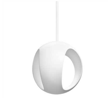
Shown in white / clear