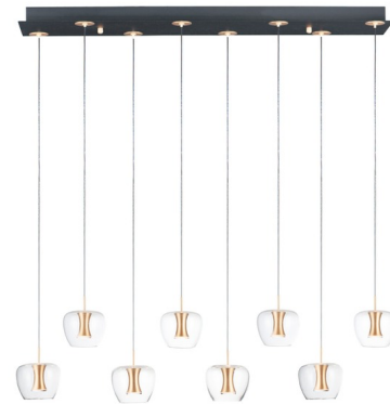
Shown in black / clear