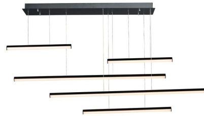
Shown in black / white acrylic