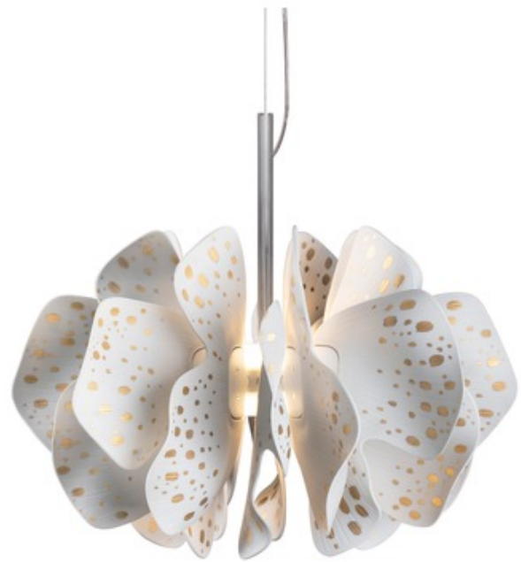
Shown in: White and Gold / Matte White

The Nightbloom Pendant is part of a lighting collection created by world renowned design, Marcel Wanders. A novel, contemporary design that stands out for its ever-changing organic forms inspired by nature and for the fascinating effect that the light emanating from inside produces in the petals. Place this handcrafted pendant in over the dining table or in an entryway to make an elegant statement. Available in two sizes. CE and UL listed.