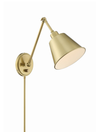
Shown in aged brass

The Mitchell Wall Sconce flawlessly combines form and function. With an extendable arm, the Mitchell works well for task lighting in transitional spaces. Place it on the bedside for nighttime reading or in the office for focused lighting. On/off dimming switch located on the back-plate. Available in two sizes and finished in Aged Brass, Matte Black, or Polished Nickel. UL and CSA rated.