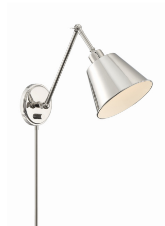
Shown in polished nickel

The Mitchell Wall Sconce flawlessly combines form and function. With an extendable arm, the Mitchell works well for task lighting in transitional spaces. Place it on the bedside for nighttime reading or in the office for focused lighting. On/off dimming switch located on the back-plate. Available in two sizes and finished in Aged Brass, Matte Black, or Polished Nickel. UL and CSA rated.