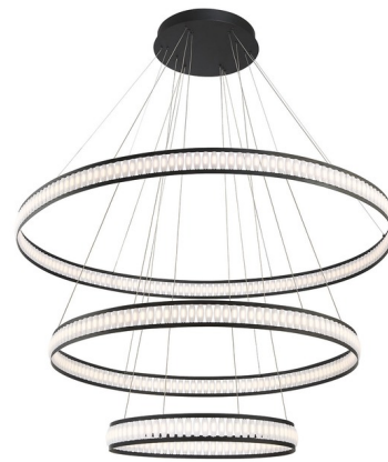
Shown in black / white

PRODUCT DIMENSIONS . . . . . Max Overall Height: 185.75" COLOR RENDERING . . . . . 80 CRI LAMP COLOR . . . . . 3000K LUMENS/WATT . . . . . 60.00 LUMINOUS FLUX . . . . . 18000 lumens