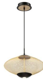
Shown in black / gold

PRODUCT DIMENSIONS . . . . . Max Overall Height: 88" COLOR RENDERING . . . . . 85 CRI LAMP COLOR . . . . . 3000K LUMENS/WATT . . . . . 57.00 LUMINOUS FLUX . . . . . 570 lumens