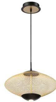
Shown in black / gold

PRODUCT DIMENSIONS . . . . . Max Overall Height: 88" COLOR RENDERING . . . . . 85 CRI LAMP COLOR . . . . . 3000K LUMENS/WATT . . . . . 57.00 LUMINOUS FLUX . . . . . 570 lumens