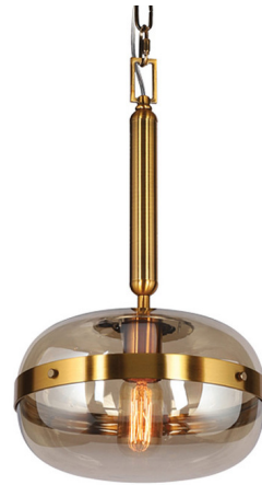
Shown in brass / amber

The Nottingham Pendant showcases a round glass shade accented by a metal band with rivets, creating a vintage feel with a hint of industrial character. Try an Edison style bulb (not included) to complete the look. This light provides a welcoming ambient glow suitable for entries, kitchens, and dining areas.