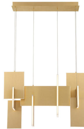
Shown in gold