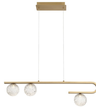
Shown in brushed gold / clear

The Phillimore Pendant features a unique design featuring a horizontal hooked arm with either 3 Lights or 5 Lights on the bottom of the arm. Available in a Brushed Gold finish complemented by Clear Textured Glass Ball shades. ETL listed.