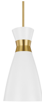
Shown in matte white / brushed brass