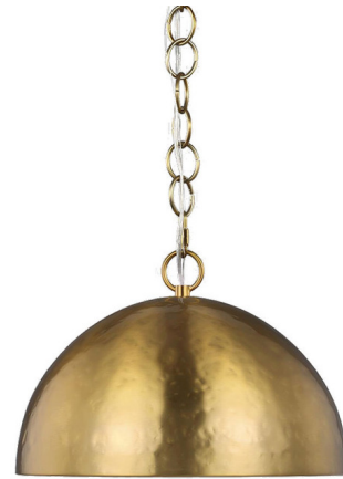
Shown in burnished brass

The Whare Pendant is a stunning example of midcentury design. A hand hammered steel shades directs the light downward and illuminates a space beautifully. Place the Whare over a dining table, in the bathroom, or anyplace where layered lighting is need. Damp location rated. ETL listed.