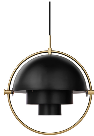
Shown in soft black / brass

The Multi Lite Pendant embraces the golden era of Danish design with its characteristic shape of two opposing outside mobile shades that enable a custom installation and a wide range of lighting in a room. By individually rotating the shades, the Multi-Lite Pendant can be transformed into multiple combinations where the light can be directed upwards, downwards or exude asymmetrical light.