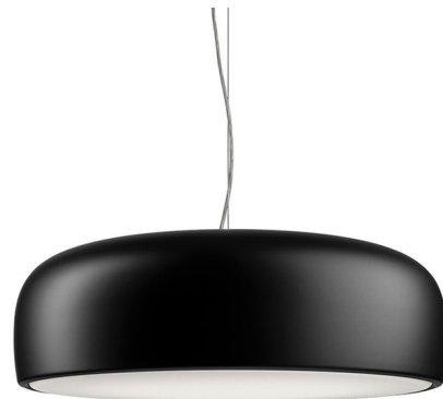
Shown in matte black / white

COLOR RENDERING . . . . . 95 CRI LAMP COLOR . . . . . 2700K LUMENS/WATT . . . . . 93.03 LUMINOUS FLUX . . . . . 2791 lumens