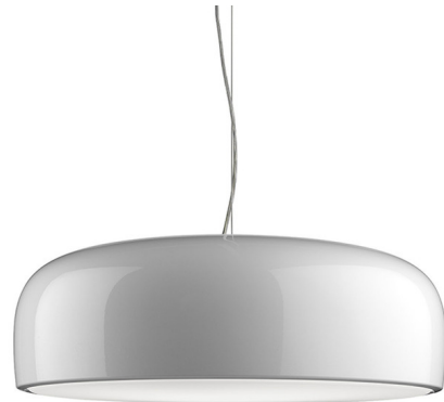
Shown in white / white