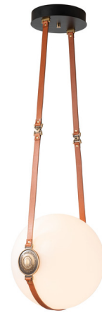
Shown in antique brass / chestnut leather / opal

PRODUCT DIMENSIONS . . . . . Canopy: 8.8" Dia COLOR RENDERING . . . . . 90 CRI LAMP COLOR . . . . . 3000K LUMENS/WATT . . . . . 45.00 LUMINOUS FLUX . . . . . 540 lumens