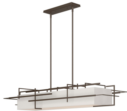
Shown in bronze / flax

The Etch Linear Pendant brings a modern take with a classic form to your interior space. The classic rectangular shade is surrounded by an abstract Mondrian-esque hand forged steel exoskeleton. Available with Standard, Short and Long length options. Canopy: 15.8 inch x 5 inch rectangle. Slope ceiling adaptable to 45 degrees. Double down-rod fixtures can be used in one direction only. The two down-rods must remain the same length. The fixtures will run parallel or along the slope, but not perpendicular or up the slope. Lifetime Limited Warranty when installed in residential setting. Handcrafted to order by skilled artisans in Vermont, USA.